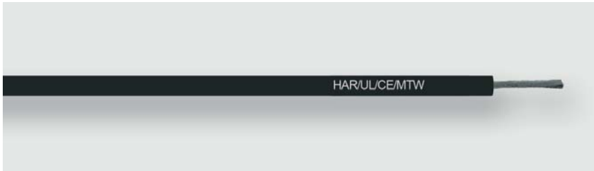
Flexible Single Conductor Hook Up Wire - Multi-Norm